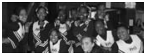
Poughkeepsie High School cheerleaders

The Pioneer cheerleaders are once again ready to support the basketball teams and help them to victory