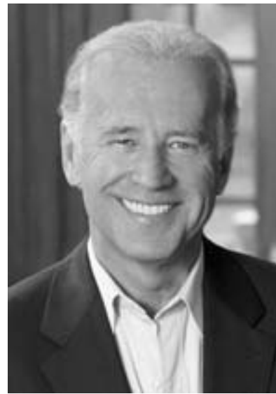
Vice President-elect Joe Biden