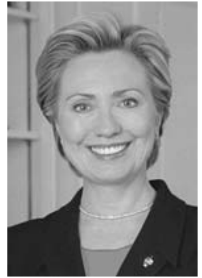
Secretary of State Hillary Clinton