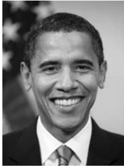
President-elect Barack Obama

Since President-elect Obama is a lover of basketball, his Cabinet would be like his own basketball team. Listed below are the top players on Obama's "Dream Team."