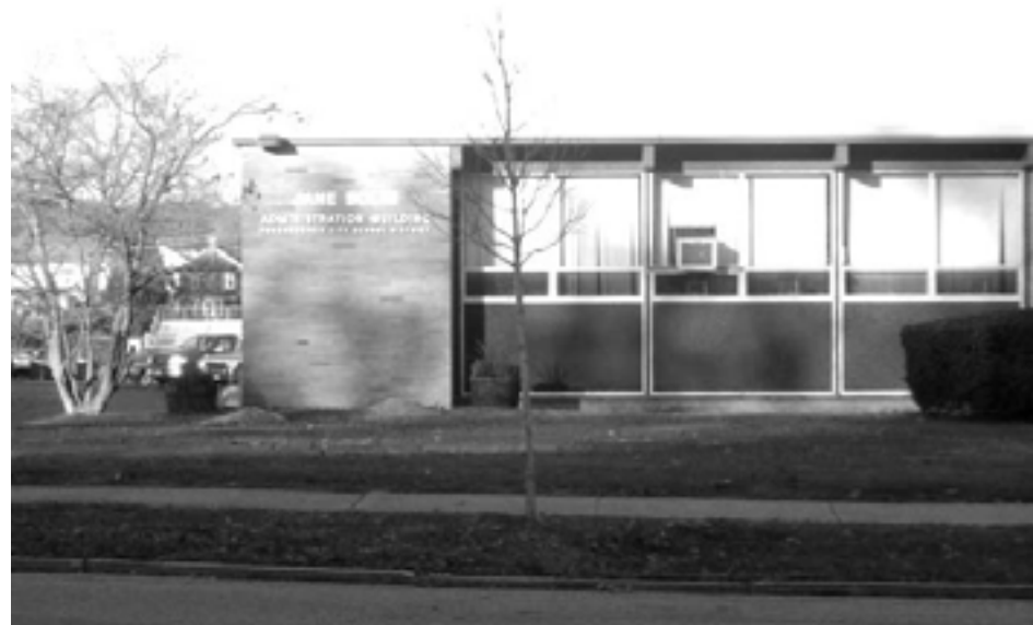
The Poughkeepsie City School District Administration building

Maybe it's just me, although who cares if Indians had to die when we have a full weekend to stuff ourselves with food. Past is past and to treat it, or appreciate it as if it mattered in the present would be foolish. Right?