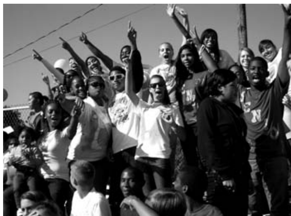
Above, seniors and juniors at the homecoming game cheering on the Pioneers.

Overall, the tradition of Spirit Week is one that is widely appreciated and anticipated every year by the attending students of PHS. With student cooperation and faculty motivation, every year Spirit Week can get better and the faults of previous years can be forgotten.