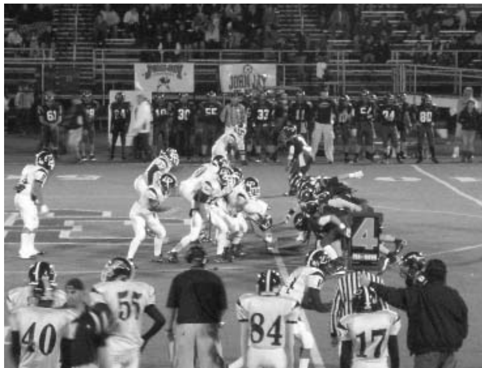
Pioneers win a close game against John Jay Cross River.