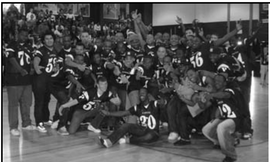
Members of the Pioneer Varsity football team gather for a picture at the Pep Rally.