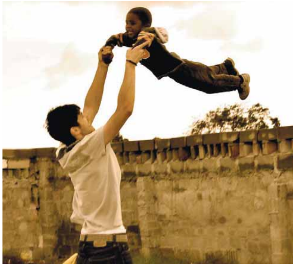
ELORA STACK/THE CIRCLE