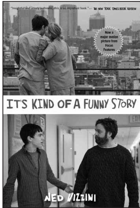
"It's Kind of a Story," based on the novel by Ned Vizzini, stars Keir Gilchrist (left) and Zach Galifianakis (right).

After getting past my initial uncertainties about the film, I was