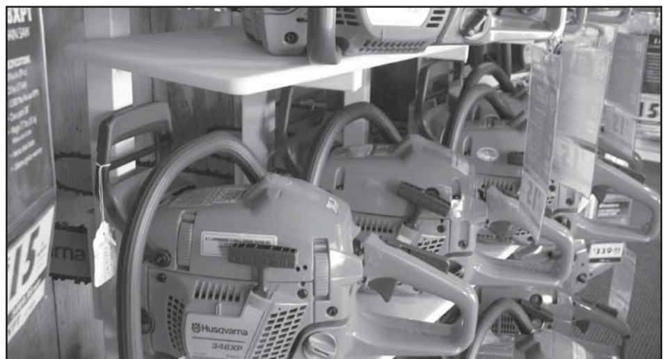
A-1 Lawnmower and Small Engine Repair, Inc. carries a full line of Husqvarna chain saws.

For more information, visit A-1 Lawnmower and Small Engine Repair, Inc. at the intersection of Rt. 376 and Lake Walton Road/Robinson Lane in Wappingers Falls or call 221-LAWN (5296).