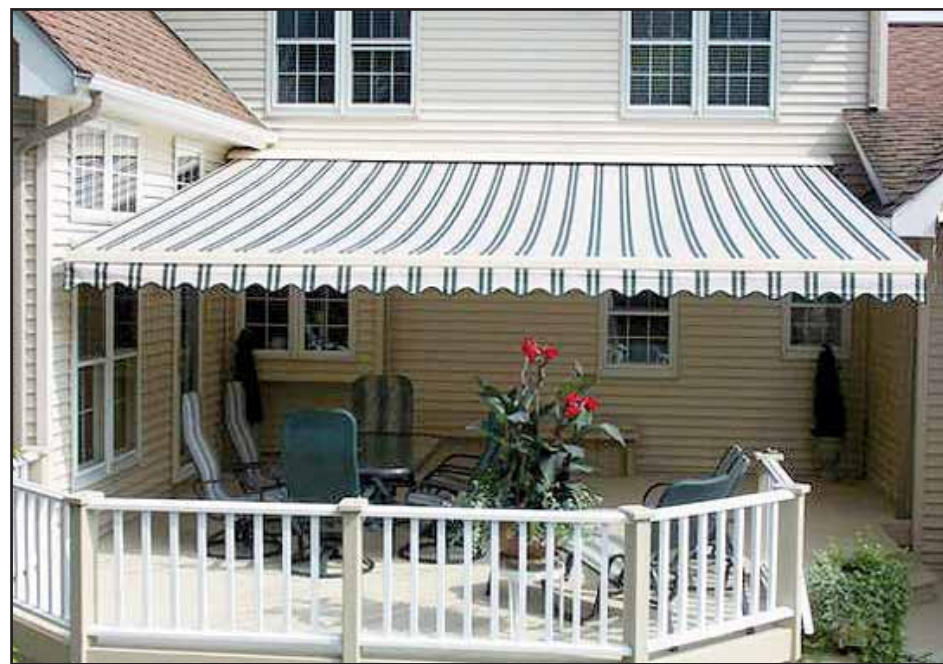
Awnings from Awing FX are attractive and offer ease of operation.