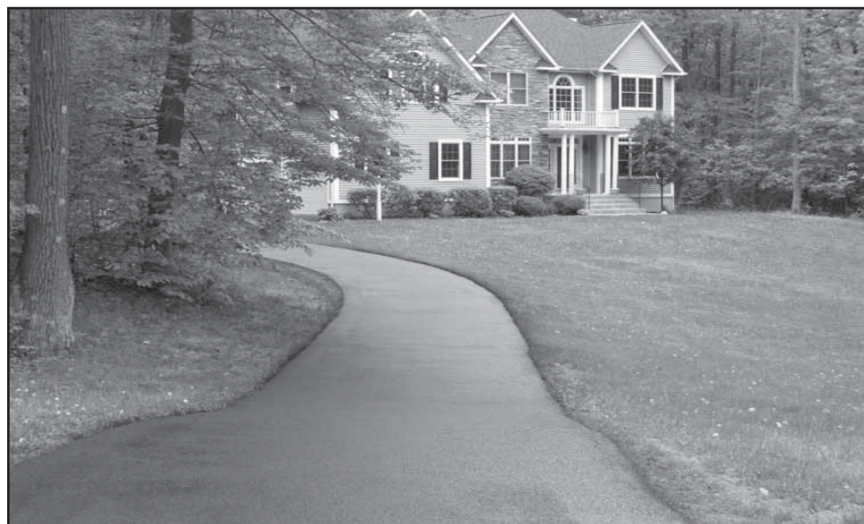
KA Landscaping can manage all of your landscaping needs, including tree work, lawn work and driveway sealing.

If you are looking for professional landscaping for your entire property at reasonable prices, then KA Landscaping is the one for you.