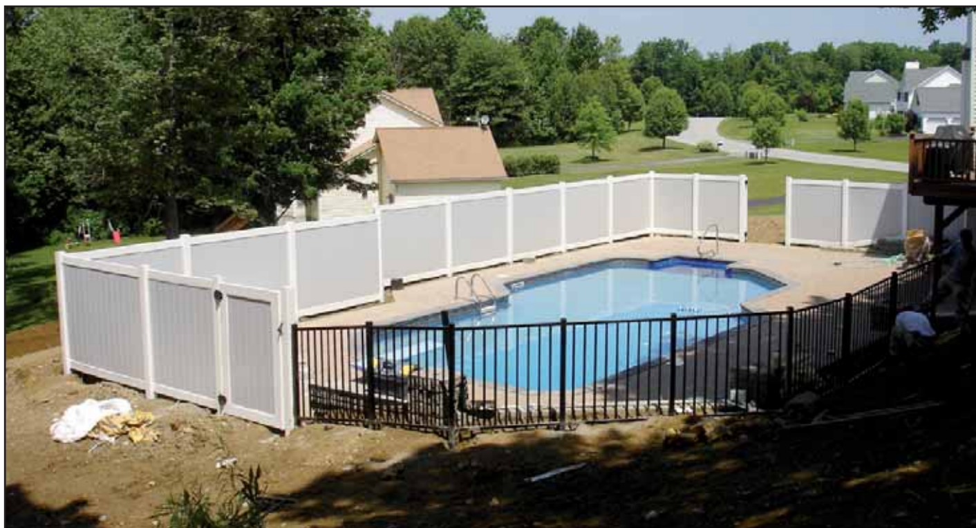
Specialty fences from Adams Fences provide clean and impressive enclosures for a backyard swimming pool.

For more information, on Ill call Adams Fences at 454-0363 or visit their web site at www.adamsfences.com . Adams Fences is located behind Adams Fairacre Farms on Rt. 44 in Poughkeepsie.