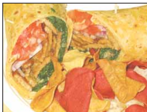
Fakin' bacon wrap with colored vegetable chips