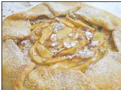
Pear Almond Galette