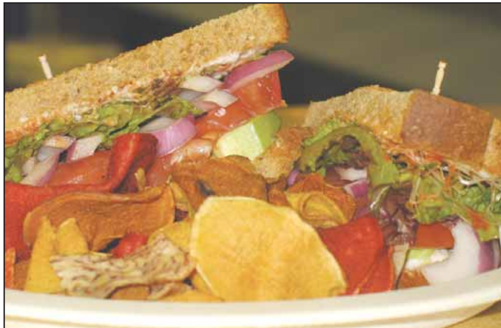
Spicy garden sandwich with vegetable chips

Our fresh case salads, or "sides" to the sandwiches, include a wide assortment of cold salads and items that change daily. Ranging from filling High-Protein and Soy-Based to light fresh fruits and vegetables. At Mother Earth's, the vast majority of our salads are Vegan and Gluten-Free.