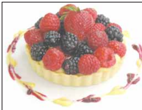
Fresh fruit with custard filling

POUGHKEEPSIE: 1955 South Rd. 296-1069 KINGSTON: Kings Mall, Rt. 9W N 336-5541