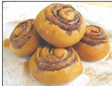
Vegan cinnamon buns